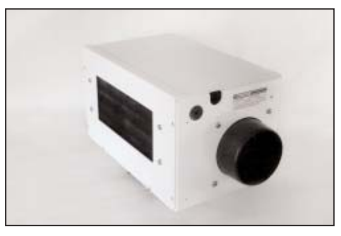
Back of compressor showing air exhaust

All BD systems feature ducted air cooling. The four-inch round intake vent is ducted to the cabin to allow the compressor to draw in ambient temperature air. This air is then forced through the compressor box to cool the electronics and pass through the oversized air cooled condenser. Exhausted air exits through the back side of the cabinet ensuring efficient performance even in tropical climates.