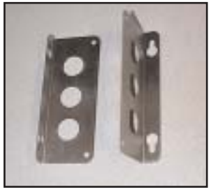
Stainless steel bulkhead brackets are available for mounting the BD compressor cabinet to a vertical wall.

The compressor is fitted with SAE-style R-134a service ports.