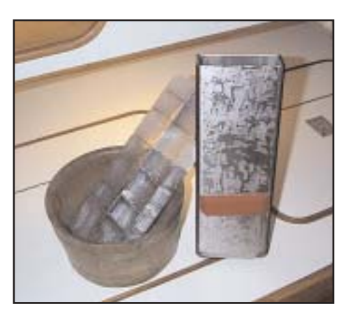
Vertical ice tray kit

Ice making trays are an option. Ice can be made with both refrigerator and freezer applications. The trays are specially made to expand when the water freezes to ice. The ice trays hang on the vertical sides of the cold plate in surface contact. Removing the frozen trays from the cold plate and allowing them to melt slightly will allow the cubes to be harvested and stored for later use.