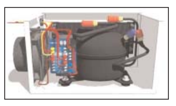
BD compressor with cover removed

BD and BDxp units come pre-charged with R-134a refrigerant. The copper lines from the cold plate connect to the compressor with brass Aeroquip <sup>®</sup> connectors which are self-sealing and may be disconnected without loss of refrigerant.