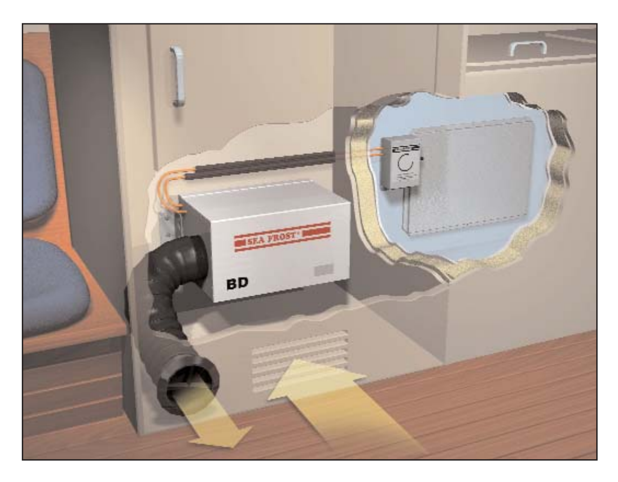
Diagram of an Air Cooled Installation

Ducted air cooling creates the highest efficiency and allows installation in confined areas such as a sail locker, or under a cabinet or seat. The ducting eliminates recirculation of the cooling air. The air temperature increase is minimal (2° to 3° F.). Air flow can be reversed.